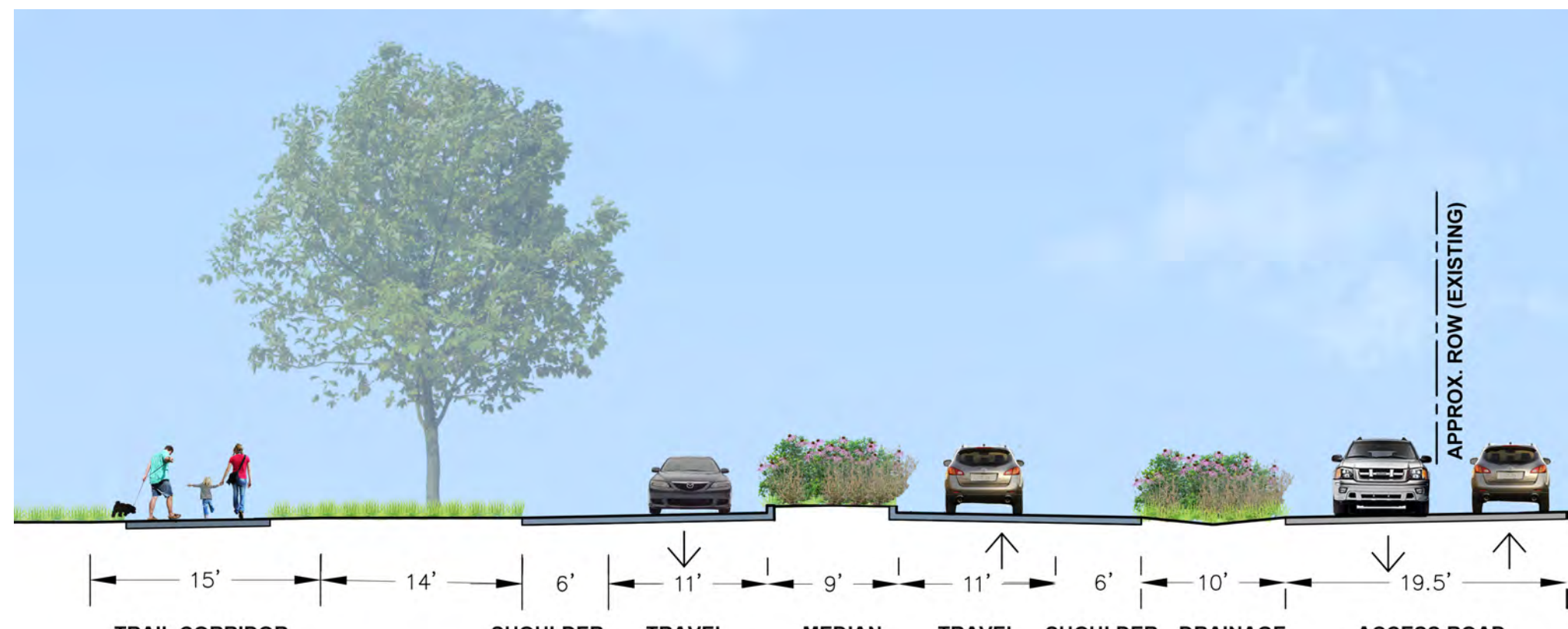
Section A - Splitter at Arkansas Ave