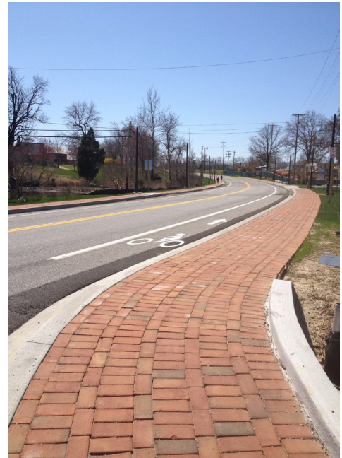
Pedestrian and bicycle facilities were completed along Maryland Route 5 through St. Mary's College in 2015.